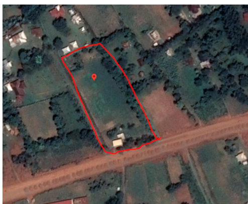
The plot in Mungatsi where the center will be built.

Moffat mentioned that they are engaged in several projects, including well construction, sewing classes, agriculture, and more, to support the local community in livelihood and talent development. ACSO recently acquired land in Mungatsi Village to build a Hope Center for their activities and to provide training and employment opportunities for people with disabilities (e.g., deafness, muteness, blindness, etc.). Moffat has inquired whether KingdomIT can provide IT training and assist in setting up a computer lab. In the coming months, we will engage in discussions on this matter.